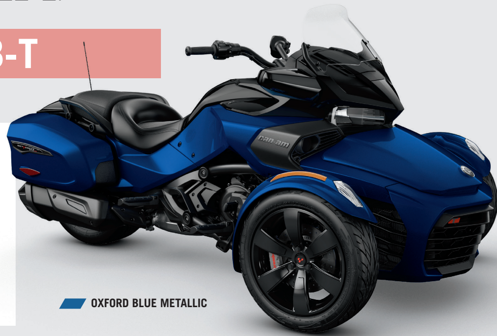
OXFORD BLUE METALLIC